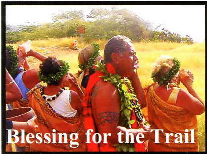
Blessing for the Trail

The Kihei Trail has been built and maintained by volunteers since 2002 and is a small part of the entire South Maui Coastal Heritage Corridor extending from Makena to Kealia Pond. There are benches and interpretive signs along the way and you can enjoy beautiful vistas; watch for whales, turtles, or native seabirds; and visit beaches and shops by continuing to walk further north and south. As you come to resort properties, please be respectful and walk along the property perimeters. Currently, many native plants have been reintroduced to the area and invasive plants are being removed. The volunteers are also exploring the possibility for more handicap accessibility. If you would like to volunteer your time to work on the trail, please join us any Monday morning. For more info: www.SouthMauiVolunteers.com